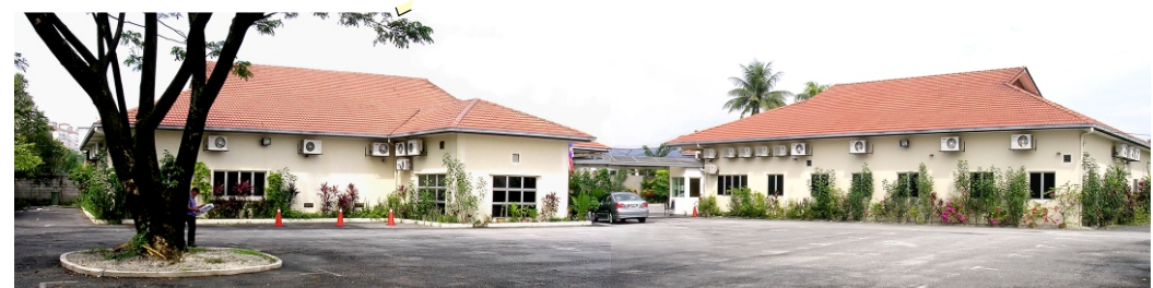
Venue: No.15, Dewan Freemason, Jalan 18/16, Taman Kanagapuram, Petaling Jaya, Selangor.